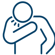
Elbow cough/ sneeze