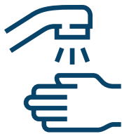
Wash your hands often