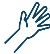
Avoid touching eyes, nose, mouth with hands