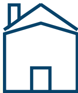
Stay home if you are sick