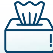
Cough in tissues and throw away

For accurate up-to-date information If you have general questions about COVID-19 call