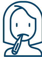
Avoid contact with sick person